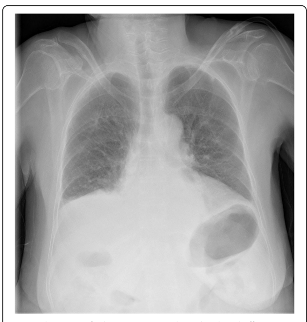
Fig. 3 Chest X-ray findings on POD 3. The right pleural effusion improved after tolvaptan administration, and no signs of pneumonia were found

On POD 4, at around 19:00, she showed disturbance of consciousness. We suspected that this condition was