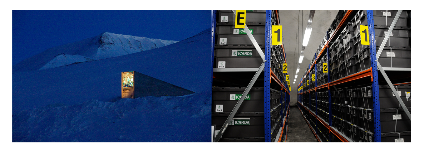
Figure 1. The Svalbard Global Seed Vault. The exterior and interior of the Svalbard Global Seed Vault. doi:10.1371/journal.pone.0064146.g001

This is in line with conclusions reached in 2004 by the international committee that undertook the feasibility study for establishing the Seed Vault. That committee formulated the need for the Seed Vault based on the following threats to the ex-situ system: "Individual genebanks are vulnerable to a host of problems that can endanger their collections, including poor management, lack of adequate funding, equipment failures, and natural catastrophes, civil strife, war, and acts of terrorism." [22]. The committee concluded that Svalbard is a unique and appropriate location for an international safety duplication facility due to several security, physical and political factors: 1) The permafrost offers natural freezing and provides unparalleled insulation properties for the seeds, even in the unlikely case of breakdown in the cooling equipment; 2) Svalbard offers a unique combination of remoteness and accessibility, providing security from human-related dangers while at the same time allowing transportation of seeds in and out; 3) Military activity is prohibited under the terms of the International Treaty of Svalbard; 4) The political situation is stable, and the highly