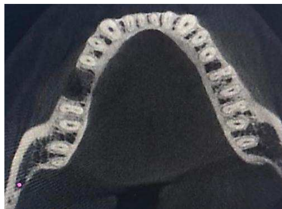
Figure 2. CBCT axial view showing the orifice of canals

Over 1000 CBCT scans were evaluated to find 110 CBCT images of bilateral erupted, semi erupted or impacted mandibular third molars without caries, internal/external root resorption, open apices, previous endodontic treatment or root fracture. Based on a pilot study on 10 patients, sample size was calculated to be 110 CBCT scans. In this cross-sectional study, CBCT images of patients between 22 to 50 years that had been obtained for purposes other than this study (such as extraction or implant placement) were retrieved from the archives of the Oral and Maxillofacial Radiology Department of Islamic Azad University, Tehran. Of 110 patients, 55% were females and 45% were males. The patients had a mean age of 25.02 \pm 2.21 years. Since presence of both mandibular third molars was imperative for this study, the majority of patients who met our inclusion criteria were