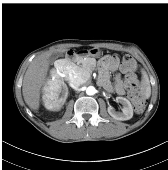
Figure 2 CT scan showing involvement of infradiaphragmatic juxtahepatic part of inferior vena cava.

Cardiac part of operation was performed first. Chest was open through median sternotomy and cardiopulmonary bypass (CPB) was established by cannulation of both venae cavae and ascending aorta. After clumping the aorta heart was stopped by cold blood cardioplegia, and both valves were repaired - dilated mitral annulus with C-G Future Band (Medtronic Inc.USA) and