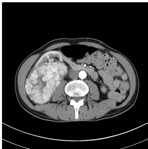
Figure 1 CT scan showing large tumor of the right kidney.

(amiodarone 0,2 g), anticoagulant (enoxaparin 0,06 g), potassium and magnesium.