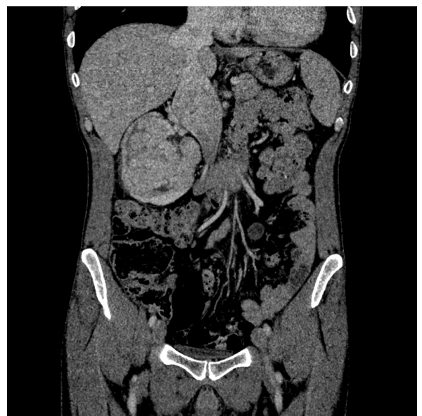
Figure 3 CT reconstruction of the abdomen showing the size of the renal mass and the thrombus.

tricuspid annulus with De Vega plasty. After aortic clamp was removed heart rhythm was restored with DC shock. CPB was discontinued without problems, patient was decannulated, heparin reversed with protamine. Transoesophageal echocardiogram confirmed good result of valves repair. The extracorporeal circulation time was 72 minutes, the aorta was clumped for 49 minutes.