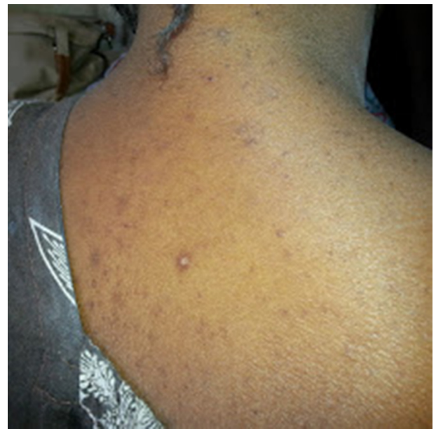
Figure 1. Disseminated Vasculitis Purpura on the Back

Malaria tests had negative results. Complementary investigations revealed CRP of 96 mg/L, central pancytopenia with severe anemia 5.1 g/dL, neutrophilic leukocytopenia with 2000 leucocytes/mm 3 and neutrophils 700/mm 3 , thrombocytopenia 47000/mm 3 , and reticulocytes 67000/mm 3 . Natremia and kaliemia were normal. Other paraclinical findings showed increased ferritinemia at 4692 (23 times more than the normal range), LDH 468 IU/L (twice the normal) and hypertriglyceridemia 2.52 g/L (1.5 times the normal). Serum calcium and phosphorus were within normal ranges. Due to these clinical and biological findings, a bone marrow aspiration was performed, which found medullary invasion by macrophages with signs of hemophagocytosis (Figure 3).