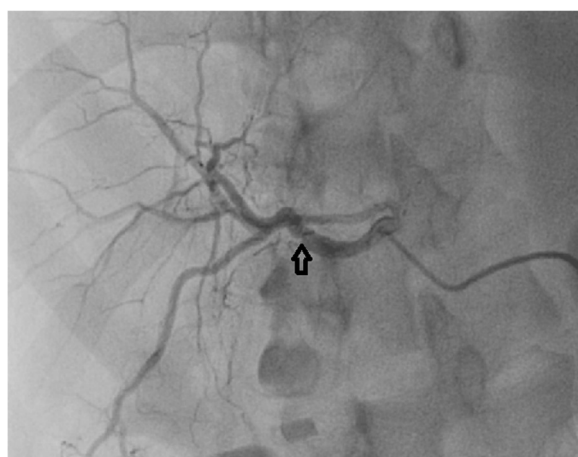
Figure 2 Post coil embolization check angiography showed that the coil had migrated into the right branch of hepatic artery (Arrow).

could be palpated in the right branch of hepatic artery distal to the origin of the cystic artery. Vascular slings were passed in proximal and distal portion of the right hepatic artery. An arteriotomy was performed just proximal to the coil. At the time of arteriotomy no bleeding was observed however immediately after removal of a clot lodged in the proximal segment of the artery profuse bleeding was noticed on loosening of the proximal vascular sling. However still no back bleeding was seen distally, subsequently upon retrieval of the endocoil significant back-bleed was observed. Immediately after repair of the arteriotomy, pulsations returned in the proximal segment of the artery. There was no leak. The elapsed time from embolization to arterial repair was approximately 4 hours.