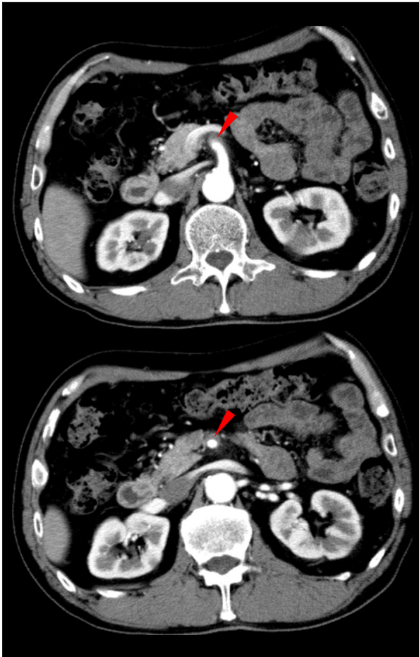
Figure 2. Contrast-enhanced CT scanning showed an superior mesenteric artery dissection (SMAD) without evidence of aortic involvement.

The patient was admitted to the intensive care unit and treated conservatively with bowel rest, fluid resuscitation, and analgesic and antihypertensive medication. The back pain improved gradually. On day 3 of admission, ultrasonographic assessment confirmed the blood flow of the SMA, without signs of progressive true lumen narrowing, and the patient was transferred to the general ward. On day 10 of admission, the patient underwent another contrast-enhanced CT scan, which showed maintenance of true lumen patency of the SMA. The patient remained stable and recovered without any complications. He was discharged on day 25 of admission.