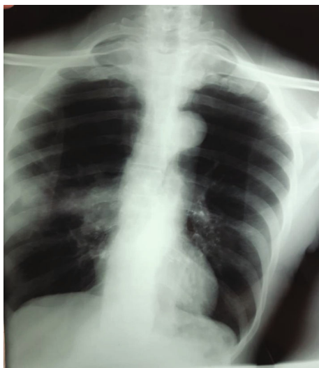
FIGURE 1: The posteroanterior chest roentgenogram showed homogeneous right hilar opacity with peripheral nodular opacity with spiculated contours.