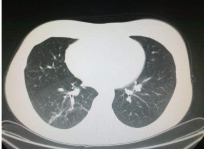
Figure 3. Resolution of the infection.

In June 2012, the MUD transplant was performed; because of an engraftment failure, the patient underwent a second stem cell infusion from the same donor in August 2012, which was followed by a