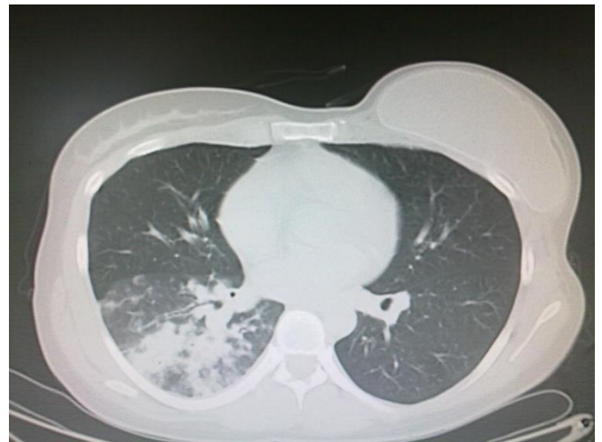
Figure 1 . CT Scan at diagnosis of AML: bilateral basal parenchymal consolidation with a consensual right pleural effusion.

Liposomal amphotericin B (L-AmB) at 5 mg/kg/day was then started after 9 days of antibiotic therapy. The clinical conditions worsened, with recurrent episodes of hemoptysis, persistent positivity for mucor in expectorations and parenchymal consolidation of