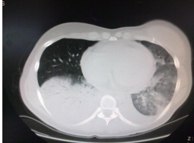
Figure 2. CT Scan before posaconazole treatment.