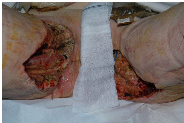
Figure 2 Photograph showing both groin wounds (day-12) with patchy areas of necrotic tissue and slough. The adjacent skin appears healthy with the formation of clean granulation tissue at the wound margins.

On day-36, a repeat MRI was performed to investigate persistent bilateral groin sinuses. This demonstrated extensive oedema of all the muscle groups around the pelvis, most marked in the region of the obturators and the adductor muscles in the proximal thigh and bone marrow oedema in the symphysis pubis suggestive of osteomyelitis. Biopsy of the symphysis pubis corroborated the pres-