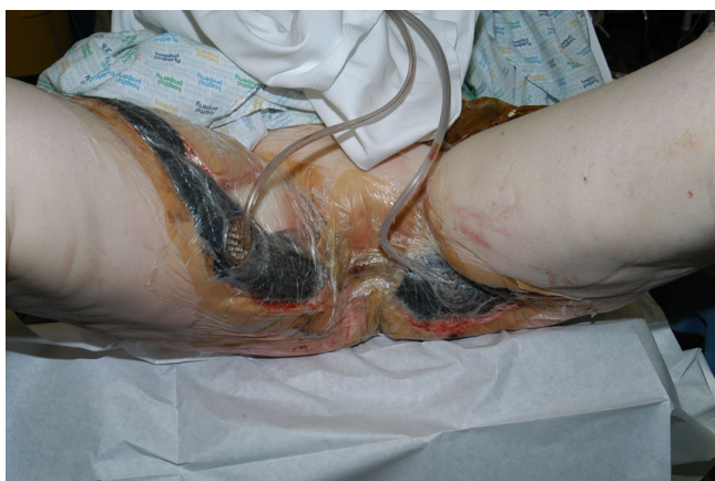
Figure 3 Photograph showing both groin wounds and perineum (day-20) with VAC system in place. The wounds already appeared smaller with healthy adjacent skin.

ence of osteomyelitis with collections of acute inflammatory cells and some reactive debris in the marrow space in combination with viable and necrotic bone. A gram stain showed some gram-positive organisms similar to those seen on the original biopsy, suggesting a residual nidus of infection in necrotic bone. The patient remained on long-term antibiotic therapy with continued application of the VAC dressing system as further surgical intervention was deemed inappropriate (Figure 4). VAC therapy was discontinued on day-51. The patient was discharged 3-months post-admission with both groin wounds fully healed. She remains well 16-months later with no further signs of soft tissue sepsis or osteomyelitis.