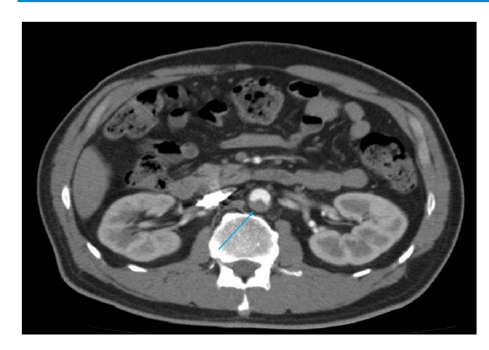
figure 1 Urgent CT aortography showed severe and extensive atherosclerotic plaques (nearly 50% blockage).

with warfarin may help complete resolution of atheromatous disease/aortic thrombus.