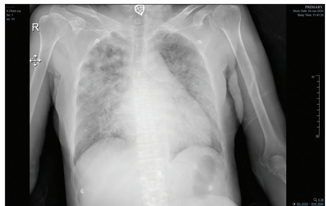
Image 1: Chest X ray AP view showing diffuse bilateral ground glass opacities. (Jai Prakash Narayan Apex Trauma Centre, All India Institute of Medical Sciences, New Delhi)

At our institution, all patients presenting with Severe Acute Respiratory illness (SARI) or Influenza like illness (ILI) are admitted in a holding area where they are tested for COVID and managed. If the test results are positive for COVID, they are transferred to the dedicated COVID hospital. If the test results are negative, they are transferred to the admitting unit. This works well in our setting and allows us to physically isolate suspected patients. This is in accordance with WHO guidance which suggests that any patient with severe acute respiratory illness (fever and at least one sign/symptom of respiratory disease, e.g., cough, shortness of breath; AND requiring hospitalization) and in the absence of an alternative diagnosis that fully explains the clinical presentation be treated as a suspect. [22]