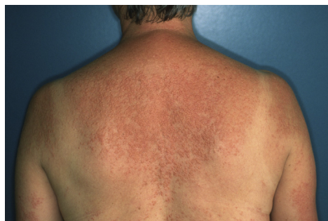
Fig 1. Clinical presentation of the cutaneous sarcoidosis shows lichenoid eruption on back and arms.