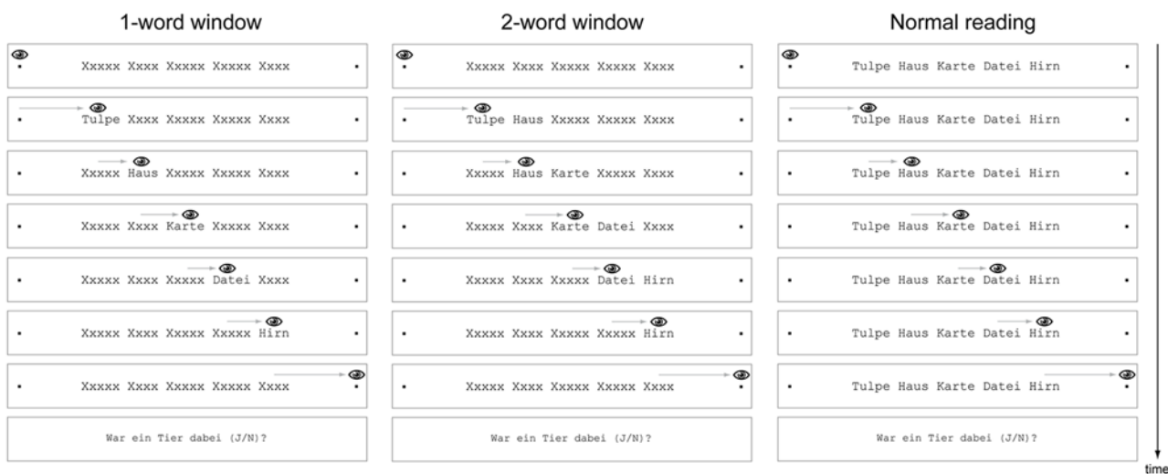
Fig 2. Trial scheme for the list reading task. Participants read short lists of German nouns from left to right with eye movements. Depicted is an example trial in the three preview conditions: 1-word moving window (left), 2-word moving window (middle), and normal reading (right).

Fig. 2 depicts the trial sequence. Each reading trial started with a fixation check on the left fixation point. After a successful fixation, the full list of five words (or placeholder masks) appeared on the horizontal midline of the screen. As the gaze moved across the list, the currently fixated word and—depending on the condition—also the following word was unmasked gaze-contingently. In the normal reading condition, regressive saccades towards earlier words in the list were possible. In contrast, in the moving window conditions, words were remasked and stayed masked