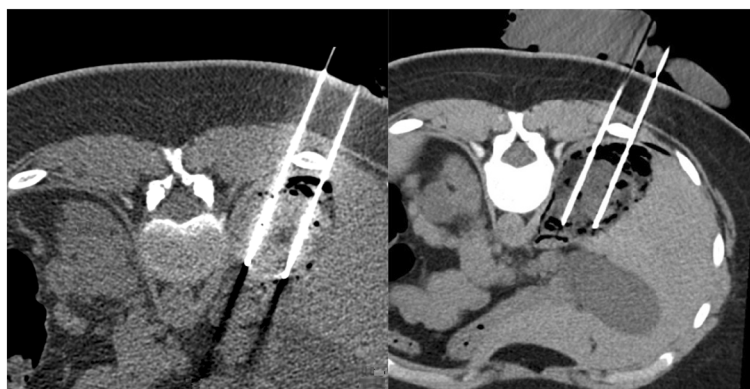
Figure 2 Axial computed tomography (CT) slice showing 2 cryoprobes in the AML. The bowel and the liver has been pneumodissected. Left image is before freezing and right image is after freezing.

Renal function remained normal and stable throughout follow up, although a mild proteinuria (0.13 g/g of