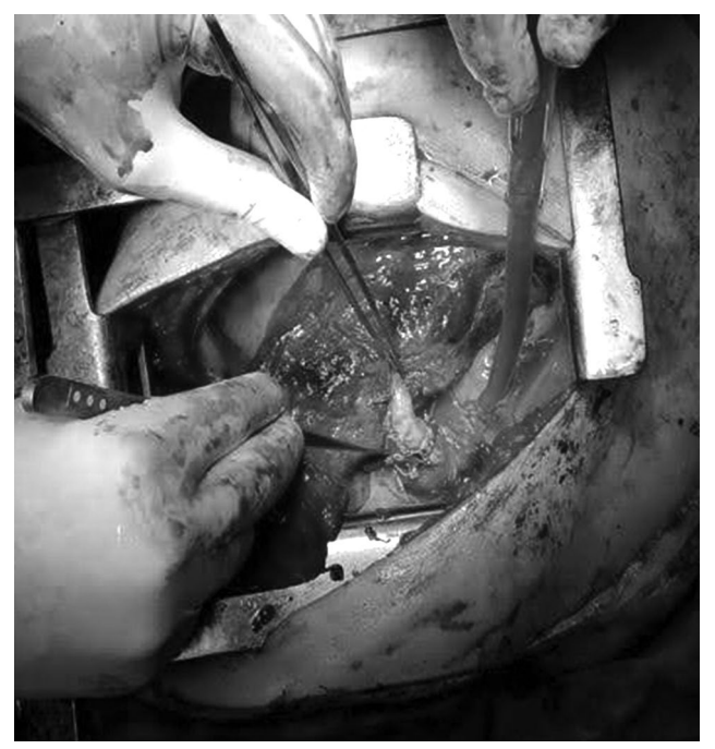
Figure 2. Intraoperative view of pulmonary artery patchplasty with autologous pericardial graft.