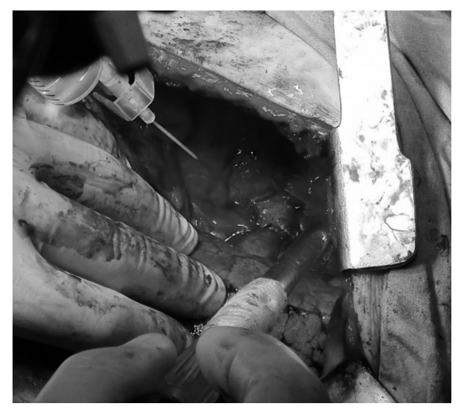
Figure 4. Intraoperative view of pulmonary artery end-to-end anastomosis.