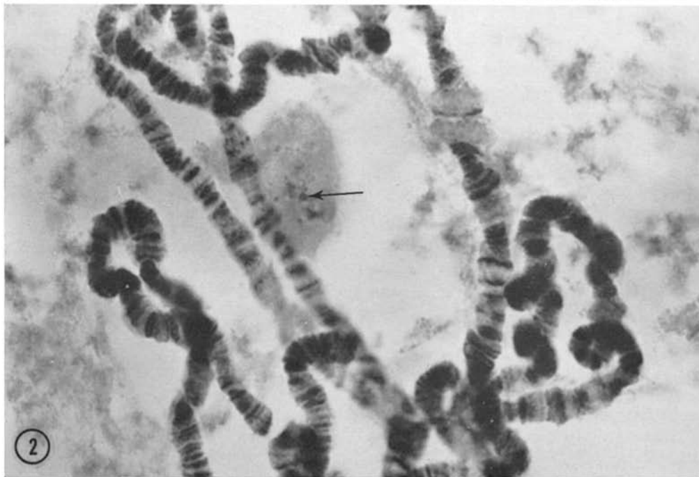
FIGURE 1 Aceto-orcein squash preparation; Jones and Cunningham medium with serum. Chromosome banding is very precise; nucleolus and intranucleolar thread are clearly distinguishable. Arrow points to intranucleolar thread. \times 1800 .