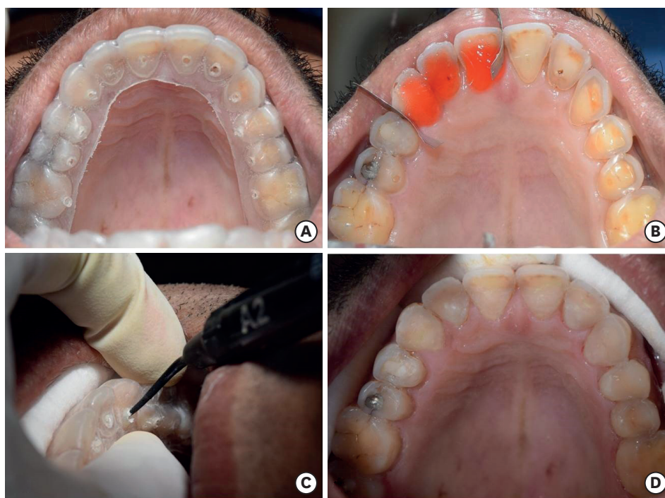
Figure 4. Restorative protocol. (A) Oral try-in of the splint matrix. (B) Acid etching of the teeth in segments. (C) After the bonding protocol, flowable composite was injected. (D) Composite restorations were finished and polished.

After try-in of the matrix ( Figure 4A ), the teeth were etched in groups ( Figure 4B ), and bonding agent was applied (Adper Single Bond 2, 3M ESPE, Bangalore, KA, India), air-thinned, and cured. Following placement of the matrix on the maxillary arch, flowable