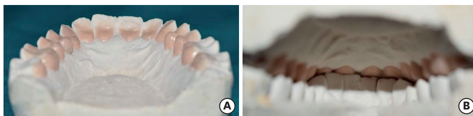
Figure 2. Wax-up. (A and B) Wax-up was done to build up the gingulum and functional cusps.