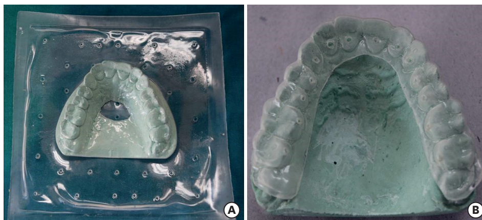
Figure 3. Fabrication of splint. (A and B) A vacuum-forming splint matrix was adapted and trimmed.

After try-in of the matrix ( Figure 4A ), the teeth were etched in groups ( Figure 4B ), and bonding agent was applied (Adper Single Bond 2, 3M ESPE, Bangalore, KA, India), air-thinned, and cured. Following placement of the matrix on the maxillary arch, flowable