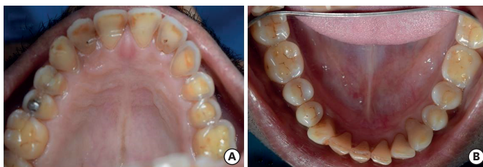
Figure 1. Pre-operative. (A and B) The pre-operative status of the dentition reveals erosion of the palatal surfaces of the maxillary teeth and the occlusal surfaces of the mandibular teeth.

The carious lesion on tooth #25 was restored. The patient was informed of the treatment plan of palatal composite veneering for the erosion-induced damage, as per the ACE classification. Alginate impressions were taken of both arches, and study models were poured. A wax-up of the palatal surfaces was done on the mounted casts ( Figure 2A and 2B ). An alginate impression was taken of the wax-up, and poured. On the latter master cast, a vacuum-forming soft splint matrix (0.9 mm thick Sof-Tray Sheets, Ultradent Products, Inc., South Jordan, UT, USA) was adapted ( Figure 3A ). Holes were drilled on the palatal surfaces of the matrix to enable the injection of flowable composite ( Figure 3B ).