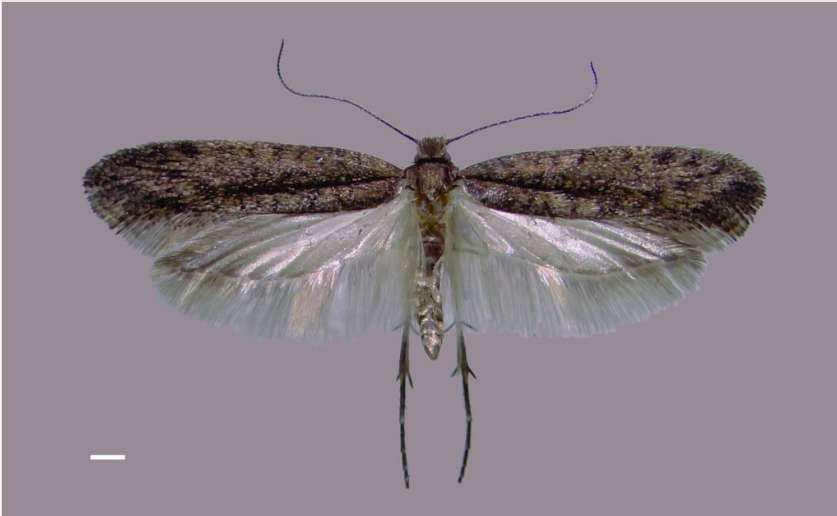
Figure 1. doi

Male holotype of Ypsolopha chicoi sp. n. in dorsal view. Scale bar 1 mm.