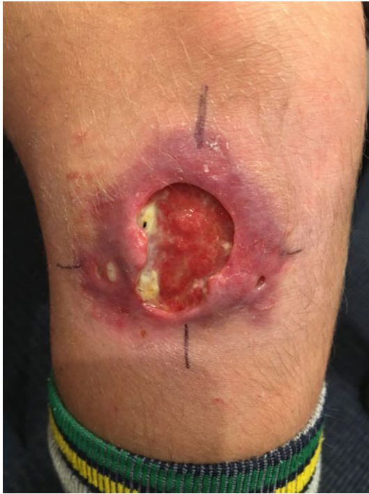
Fig. 1. A severe Mycobacterium ulcerans lesion on the knee of an 11-year-old boy.

and Fig. 2). Confirmed cases of Buruli were then reported from three countries in the 1950s; Democratic Republic of Congo (DRC) [19], Mexico [20] and Uganda [21]. Nine countries across three continents reported their first cases in the 1960s; in Central Africa (Angola [20], Congo [22] and Gabon [23]), in West Africa (Nigeria) [20], in Asia and the Pacific (Papua New Guinea [24], Malaysia [25] and Indonesia [20]) and in South America (Peru [20] and French Guiana [20]). During the 1970s, cases were reported from West Africa for the first time (Benin [20], Ghana [26], Sierra Leone [20] and Cameroon [27]). In the 1980s, Ivory Coast [28] and Liberia [29] were added to the list of West African countries recording their first cases, along with Japan [30], Kiribati [31] and Suriname [32]. In the 1990s, four countries were added from West Africa (Burkina Faso [33], Equatorial Guinea [20], Togo [34] and Guinea [20]) as well as Sri Lanka [20] and China [35] from Asia. In the 2000s, Brazil reported cases for the first time [36] in addition to the East and Central African countries Kenya [37], Malawi [20], South Sudan [20] and Central African Republic [18].