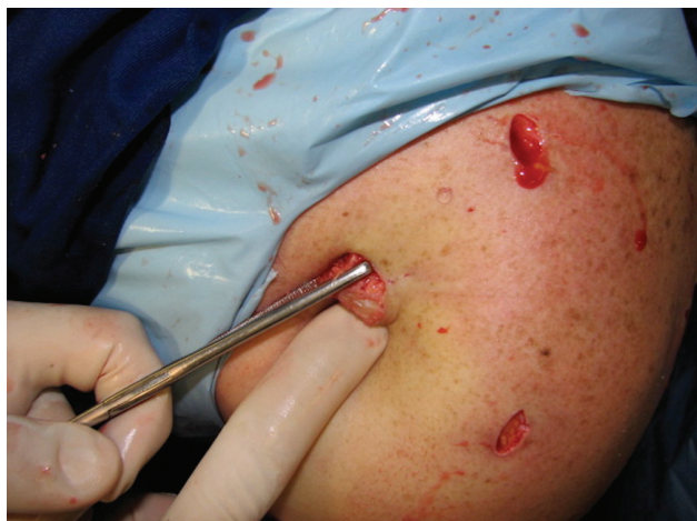
Fig. 3 Image of the left shoulder with the coracoid process externalized with the aid of a Kocher forceps.

Increasing screw torque does not necessarily mean that the graft is properly secured; to test screw tightness, a probe must be used to verify whether the washer is loose or secure.