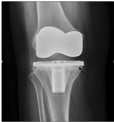
Figure 2: Radiograph (anteroposterior view) obtained at the final follow-up shows radiolucent lines in zone 1 (arrow). The patient was asymptomatic and required no intervention.

MIS for TKA, most of them have spanned over only up to 2 years of follow-up. Mid- and long-term follow-up studies are necessary to establish firmly the benefits of MIS for TKA. To the best of our knowledge, this is the first study to compare the outcomes of two common MIS techniques over a mid-term follow-up period. A follow-up of a minimum of 5 years revealed that both the MMP and the m-QS approaches afforded gratifying results, at least with respect to the clinical and radiographic parameters, in the light of the previous reports on standard TKA. [21,22]