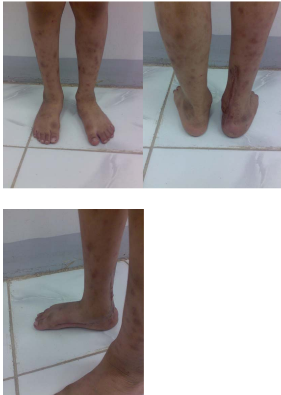
Figure 6 Final clinical presentation of the patient 38 months after surgery showing an excellent clinical outcome, with a comparable valgus hind foot angle of the right foot.

The functional rating system described above was used at the final follow-up visit to re-evaluate the feet. All the cases had excellent, (≥ 85 points), scores. The scores ranged between 85 and 95 points with a mean of 88 points.