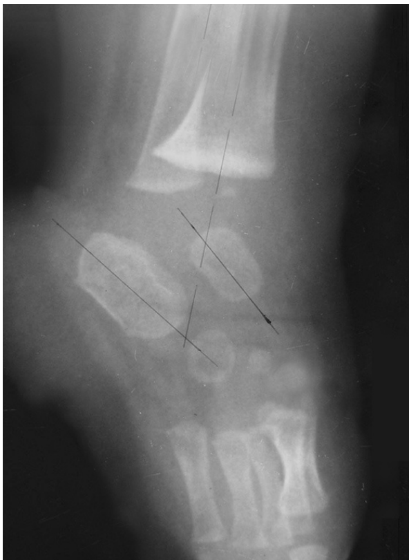
Figure 4 Preoperative plain lateral radiograph of the Rt. foot, with passive dorsiflexion of the foot, showing parallelism of the talus and calcaneus, severe equinus of the calcaneus and an acute tibio-calcaneal angle.

1. Seven feet developed wound dehiscence after removal of sutures two weeks after surgery, (they were operated