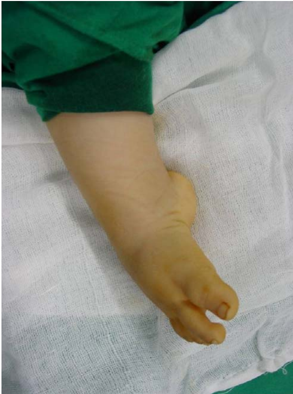
Figure 1 Preoperative photo (with patient under general anesthesia), Rt. very severe resistant CTEV in a 22 months male pt., after 12 months of serial casting at another center. Notice the medial and posterior deep skin creases, and the severe equinus deformity of the foot.

point the pin was inserted under vision to avoid injury of the calcaneal branch of the posterior tibial nerve. The calcaneus needs to be rotated so that the tuberosity moves medially away from the fibula. In this position, the cuboid was reduced on the end of the calcaneus. Pinning of the calcaneo-cuboid was not used in this study. This coronal calcaneal pin allowed for proper positioning of the calcaneus into the normal 5° valgus, provided better correction of the equinus deformity of the calcaneus, and enabled a better hand grip and control of the hind foot during casting after surgery.