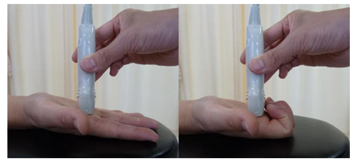
Fig. (1). Position of the probe in the sonographic study. Left and right images present the neutral position and hook grip position of transverse plane study, respectively. Sonographic evaluation was focused on the MP joint.

Each digit was evaluated sonographically at the level of the MP joint in the transverse plane. Patients' hands were positioned in supination with the wrist joint in a neutral position, and the probe was positioned with minimal pressure. The probe was so placed as the palmar surface of the proximal phalanx disappeared on the image by moving the probe from the distal to the proximal side of the MP joint. Sonographic analysis was focused on the A1 pulley and flexor tendons, and these tissues were observed in neutral position (MP, distal and proximal interphalangeal joints 0° extended position) and in hook grip position, respectively (Fig. 1). If interphalangeal joint contracture was present, the joint was extended as much as possible. The probe was positioned perpendicularly against the palmar surface of the examined digit. Images were created on a display showing a side by side comparison of the right and left digits to view the same position.