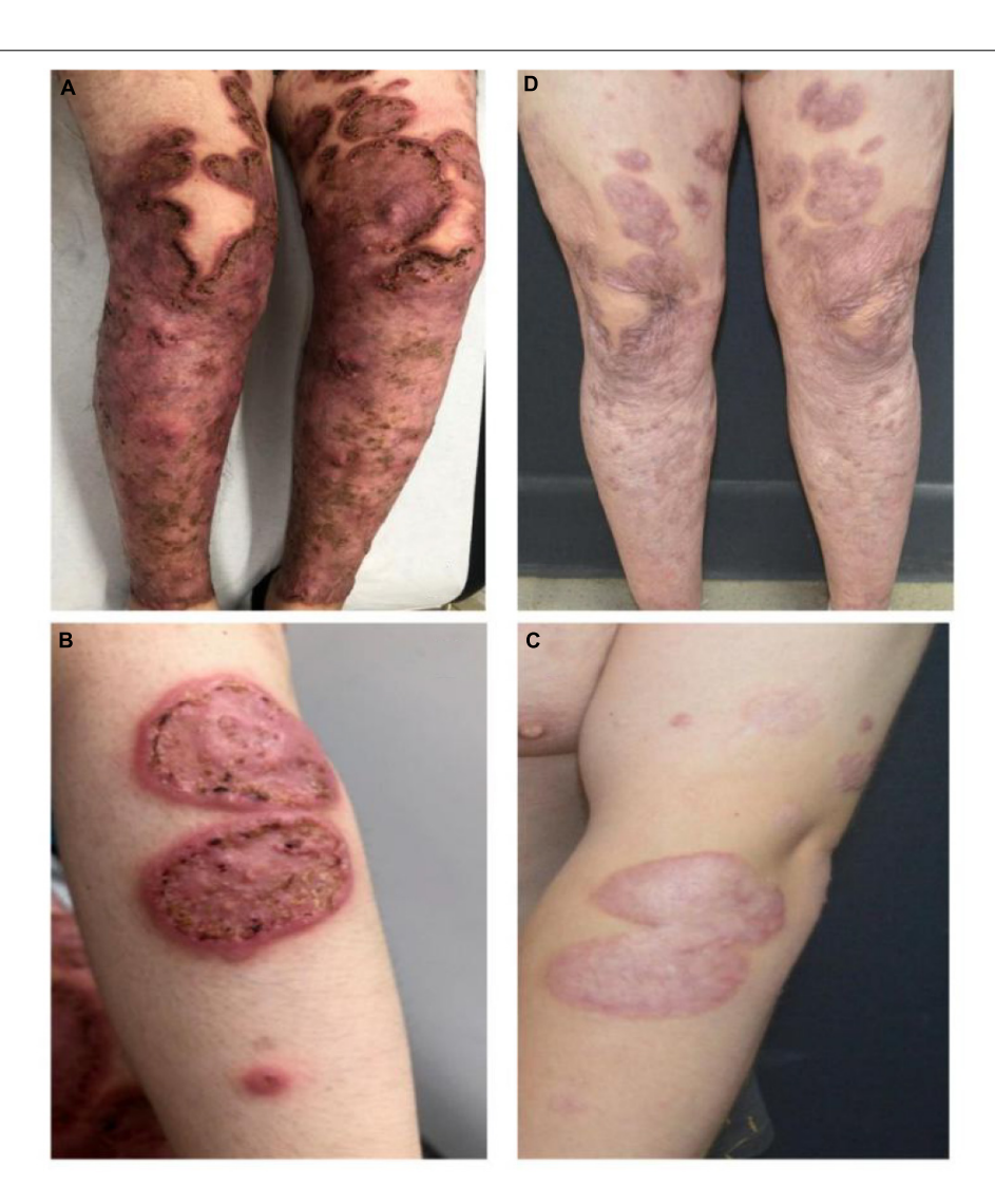
FIGURE 2 | Pyoderma gangrenosum before (A,B) and following combination therapy (C,D), the healed ulcer formed atrophic cribriform scars.

have a prevalence of 0.0058% and a higher worldwide prevalence ranging from 0.3 to 1.4%, respectively (10, 11). In contrast to other autoinflammatory syndromes within the spectrum, PASH syndrome seems to only affect the skin organ and may have a wide array of genetic changes, so the diagnosis of PASH syndromes is largely based on typical clinical presentation. Both PG and HS are contained in the spectrum of neutrophilic dermatitis, and both can occur as either idiopathic diseases or syndromic manifestations. Interestingly, the coexistence of PG and HS may indicate poor response to traditional treatment options or does not achieve sustained remission. The initial symptom of our patient was painful ulceration of both legs, which rapidly responded to prednisone. However, with the recurrence of PG and the emergence of HS, glucocorticoids alone or even combined with immunosuppressants failed to provide complete relief.