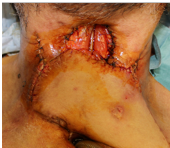
Figure 1. Preoperative view. This pharyngeal cutaneous fistula was constructed to control local infection. A bi-paddled pectoralis major flap reconstruction was planned to close the fistula.

After controlling this local infection, we planned to reconstruct the fistula by using the right bi-paddled pectoralis major muscle to close the pharyngeal fistula. A skin island including the