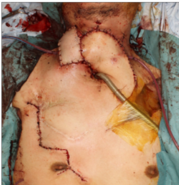
Figure 3. Postoperative view. The donor site did not require skin grafting and could be closed temporarily.

using the pectoralis major muscle flap, it is often difficult to close the pedicle with cervical skin because the pedicle is bulky with muscle. Therefore, skin grafting on the back of the inverted muscle body is usually performed [7].