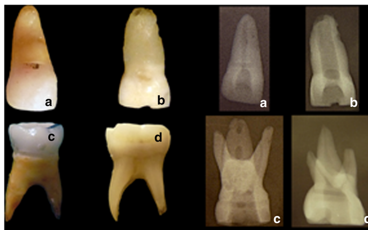
Fig. 1 Visual and radiographic aspects of examples of artificial anterior (a) and posterior (c) primary teeth compared with natural anterior (b) and posterior (d) primary teeth

Radicular pulp tissue or wax was removed by inserting and oscillating a No. #10 K-file (Dentsply Maillefer, Switzerland) to a point close to the apex. The canals were then irrigated with 1% sodium hypochlorite and dried