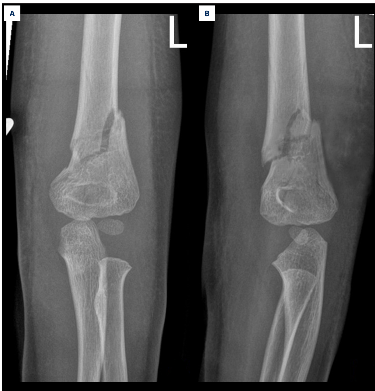
Figure 1. Pre-operative fluoroscopy of a 4-year-old boy with left distal humerus metaphyseal-diaphyseal junction (DMJ) fracture (Case 1). (A) Pre-operative anteroposterior fluoroscopy of left distal humerus. (B) Pre-operative lateral fluoroscopy of left distal humerus.

Case 4: A boy aged 3 years 6 months with a dominant right hand fell while walking and landed on his left hand. He was diagnosed with a left oblique displaced MDJ fracture of the distal humerus. The injury was treated after 3 days using the technique described above. At 22 months of follow-up, elbow motion was normal with no clinical or radiographic elbow deformity, and radiographs indicated satisfactory fracture healing.