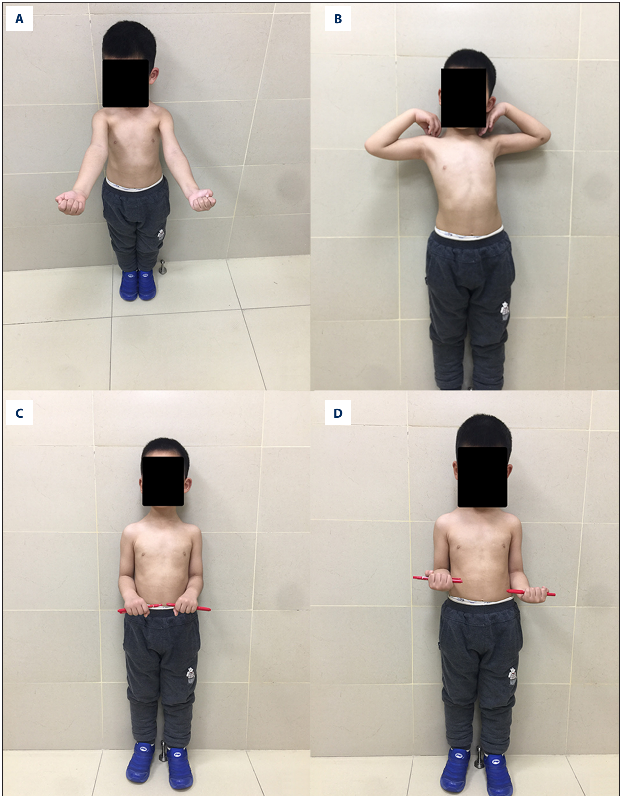
Figure 4. Clinical outcome at the last follow-up showed excellent function. (A, B) Elbow joint has normal flexion and extension function. (C, D) Elbow joint has normal pronation and supination function.