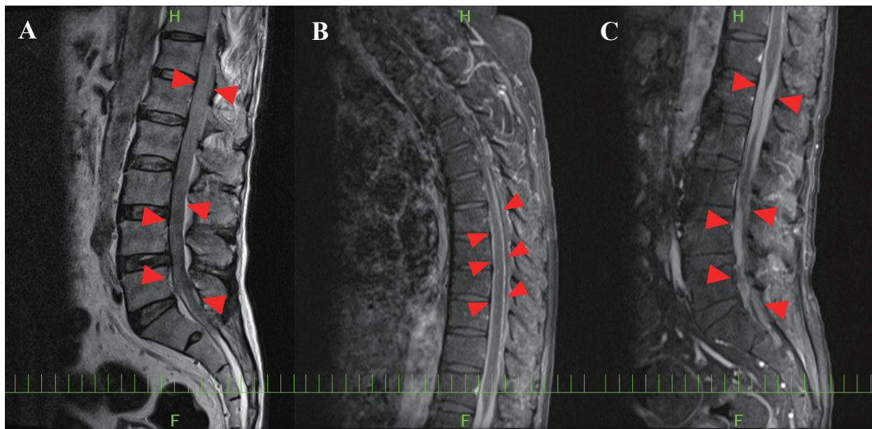
Fig. 2. Thoracolumbar MR images: T2-weighted image ( A ) and contrast-enhanced sagittal fat-saturated T1-weighted images ( B , C ). On the T2-weighted image, the CSF signal surrounding the conus medullaris is effaced. Red triangles : The leptomeningeal linear or nodular enhancement, corresponding to the intramedullary mass.