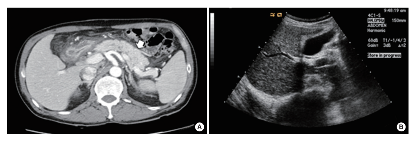
Fig. 1. Abdominal computed tomography and ultrasound. (A) Abdominal CT scan showed a swollen pancreas with peripancreatic inflammatory fat stranding, suggestive of acute pancreatitis. (B) Abdominal ultrasound showed no evidence of cholelithiasis and biliary duct dilatation.

After the withdrawal of MMI, his fever and abdominal pain improved, and pancreatic enzyme levels began to decrease and finally normalized (Fig. 2). We measured IgG and IgG4 to exclude autoimmune pancreatitis. The serum levels of IgG and