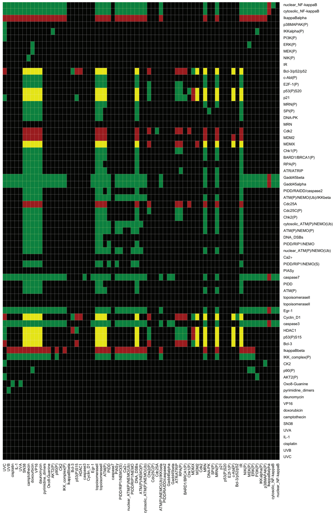
Figure 2 Dependency matrix. The dependency matrix displays network-wide interdependencies. The color of matrix element M_{ij} defines the type of the impact of species i (left hand side) on j (bottom). 23 Notes: Green, activator; red, inhibitor; yellow, ambivalent factor; black, no effect.