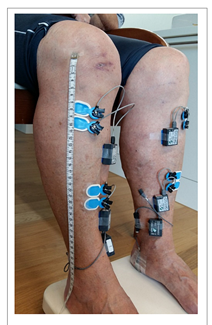
FIGURE 2 Placement over both tibialis anterior muscles of a pair of bipolar EMG electrodes using an inter-electrodes distance of \sim 2 cm in each bipolar set and a distance of \sim 10 cm between the two bipolar set of EMG electrodes to reduce the risk of cross-talk. Footswitches placed over the midpoint of each heel were placed in order to record heel-strike events during the overground gait trials.

to the preceding 400 ms. The preprocessed EMG data segments were subsequently down-sampled to 500 Hz.