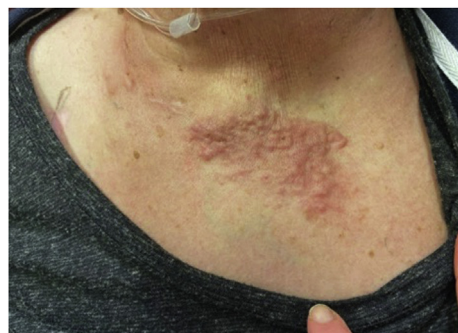
Fig 1. Pruritic papules coalescing into an indurated plaque on the anterior aspect of the chest of a 70-year-old woman.

ER: estrogen receptor GATA3: GATA-binding protein 3 PR: progesterone receptor TTF-1: thyroid transcription factor 1