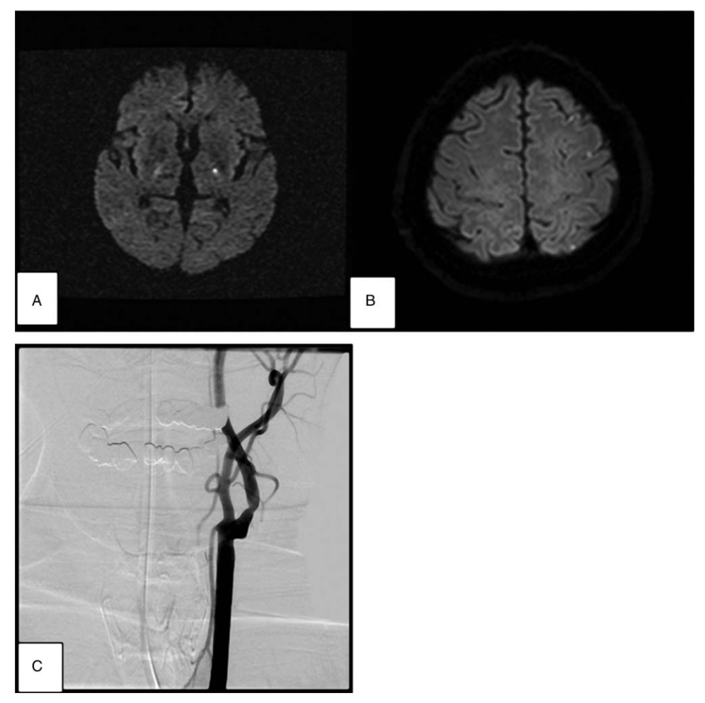
Figure 2. Brain magnetic resonance images taken after the patient abruptly manifested aggravated speech disturbance and severe cough with dysphagia. Acute infarction at left internal capsule (A) and fronto-parietal cortex (B) and stenosis of left proximal internal carotid artery (C).

On physical examination performed after 3 days from the intervention, his mental status was alert and his cognition was good. He had no definite motor weakness or sensory deficit on face or all extremities. He could walk independently. However, he had motor-type aphasia and swallowing problem. He could mutter to himself although the authors could not understand it. After the third attack, he was fed by a nasogastric tube to prevent complications such as aspiration pneumonia and malnutrition.