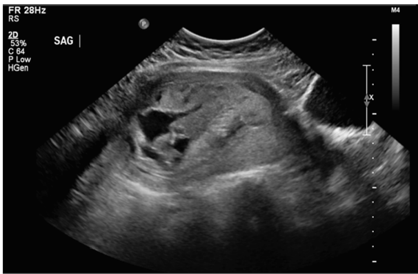
Fig. 1. Pelvic ultrasound showing an enlarged uterus with heterogeneous material.

The pathology report was consistent with a complete hydatidiform mole. A week following the operation, beta-HCG was 4161. However, on four subsequent assessments, beta-HCG remained in the 1, 000 s range (Table 1).