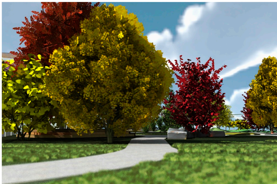
Figure 6. Most restorative scene in sample.

Paired two-tailed T-tests were performed on the index scores for each scene based upon the 3 conditions: (1) Trees Inleaf with Green foliage ; (2) Trees Inleaf with Orange foliage ; (3) Trees Leafless comparing the data arrays of each condition in pairwise fashion. Table 1 gives an overview of children's mean ratings of perceived restoration and standard deviations for each of the 12 scenes. The scenes with Inleaf trees were generally perceived as restorative with mean values on each of the four subscales above the midpoint of the 9-point rating scale. The scenes with Leafless trees were generally perceived as not restorative, with means below the midpoint of the scale with the exception of the cognitive dimension. The scene that was rated as most restorative was the scene with Inleaf orange trees shown from perspective 1 (Figure 6). The scene rated as least restorative was a scene with leafless trees shown from perspective 1 (Figure 7).