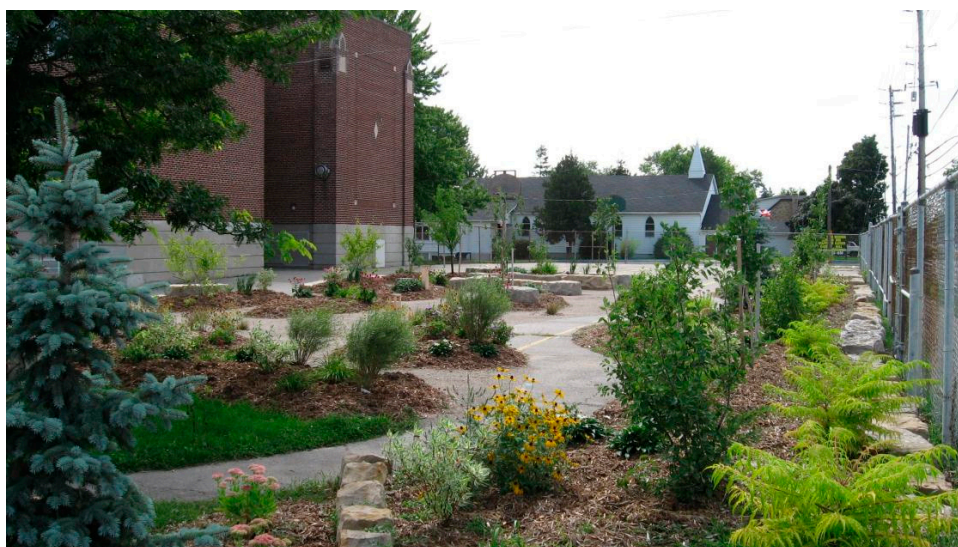
Figure 9. Subject schoolyard “greened” with seasonal planting strategy implemented.

Ultimately the findings of this research and their value to real world design will depend upon how well the results match up with the actual experience of restoration (not just self reports of projected experiences) in response to experience of the actual environment (not just visualizations of proposed design scenario). The design was installed in the spring of 2015 and is heavily used by the children who participated in the research (see Figure 9) so there exists a great opportunity for further research to expand on the findings and address some of the limitations discussed above.