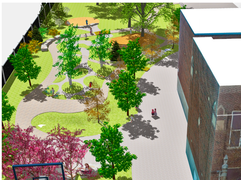
Figure 3. Three-dimensional model of proposed schoolyard greening intervention for visual communication and research stimuli images.

The elementary school utilized in this research as a case study site is located in an urban neighbourhood with low average household incomes and high levels of socio-economic distress in London [38]. For this study digital visualization images of a proposed schoolyard greening design were prepared using computer modeling techniques and specific research scenarios simulated for use in the production of the survey stimuli (Figure 3). The schoolyard at the case study school had a number of problems that the design intervention proposed to address. The existing conditions at the study school were perceived to pose a danger to students. Located adjacent to one of the city's busiest streets, the case study school had been the scene of two separate traffic incidents where cars had breached the fence at the front of the school. As a result, the entire hard surfaced area at the front of the school was deemed off-limits to the children during their recess and outdoor gym periods.