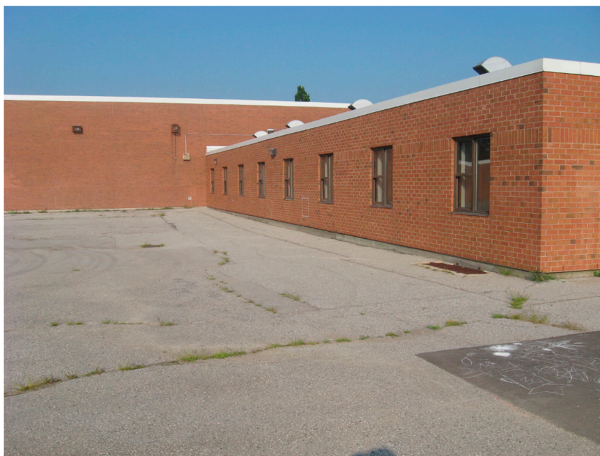
Figure 1. Photograph of a typical asphalt schoolyard.

A large expanse of forgiving turf with shade trees is a less common schoolyard experience for elementary school children. Furthermore, many schools are now removing traditional play equipment and replacing it with more asphalt, making these environments even less appealing and functional for the child user. Leading environmental designers have acknowledged this condition and are spearheading efforts to provide children with more green or natural outdoor environments that can support healthy play and learning [3]. These efforts focus on the redesign of schoolyard spaces, specifically through greening strategies. Schoolyard greening has become a niche area for landscape design professionals and organizations catering to this practice, such as REAL School Gardens, or Toyota Evergreen, have emerged.