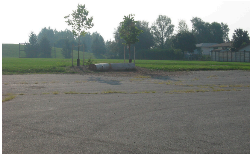
Figure 2. Photograph of typical schoolyard greening intervention in mid-summer.

or foliage that is not green. London, Ontario, Canada, which is located at the northern extent of the Carolinian zone in North America with a longitude of 42.9837°N and a latitude of 81.2497°W, has four distinct seasons wherein the majority of the trees are deciduous. The trees typically specified in schoolyard greening projects are predominantly native deciduous shade tree species (see Figure 2).