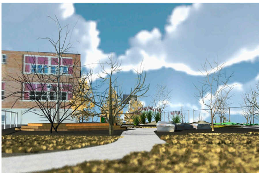
Figure 7. Least restorative scene in sample.