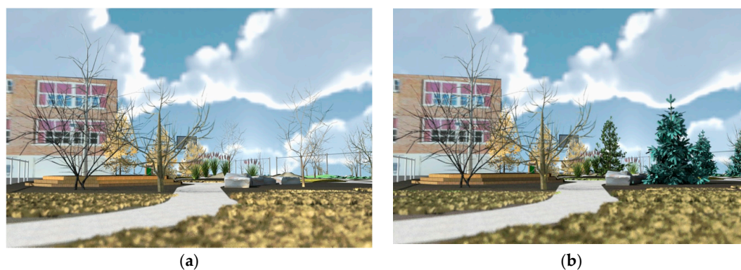
Figure 8. Comparison of Leafless condition images without (a) and with evergreen conifers (b).