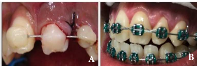
Figure 2. A) Clinical image after the surgical extrusion of the left maxillary central incisor; B) Clinical image after 8 years follow-up

Annual controls were performed. Clinical examination revealed normal soft and hard tissues, and left lateral incisor showed positive response to pulp sensitivity tests. During the first six months, monthly radiographic and clinical controls of all the involved teeth were performed. Clinical and radiographic follow-up, showed the stabilization of the horizontal root fracture in the middle third, normal soft and hard tissues, no evidences of root resorption in both teeth and a positive response to pulp sensibility tests of the left maxillary lateral incisor. After 8 years, the radiographic images suggested repairing of the left maxillary lateral incisor with deposition of mineralized tissue between the fragments ( Figure 1B-D ). Figures 2A and 2B showed the initial and final clinical images.