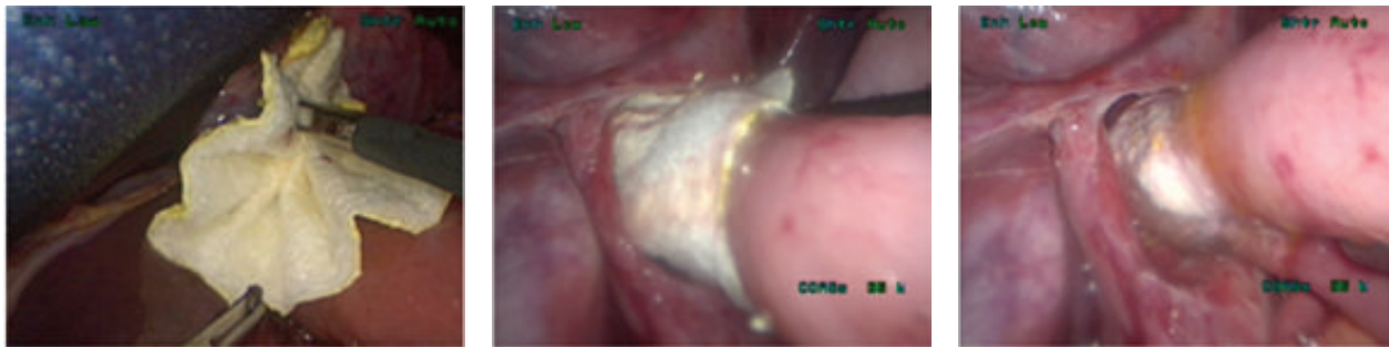
FIGURE 2: Strengthening the esophagojejunostomy with a TachoSil patch. Application by means of folding the patch in a harmonica shape.

by gently pulling either side of the patch. The patch was slowly advanced over the anastomosis and wrapped around it. To ensure adhesion, pressure was applied to the patch. No learning curve was found for TachSil application in these patients.