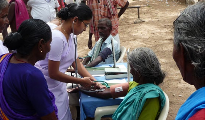
Productivity depends on right mix and number of allied ophthalmic personnel. INDIA

This article is the the first in series on evidence based eye care delivery. The series highlights the importance of using evidence for planning and effectively managing eye care – both at programme and hospital levels.