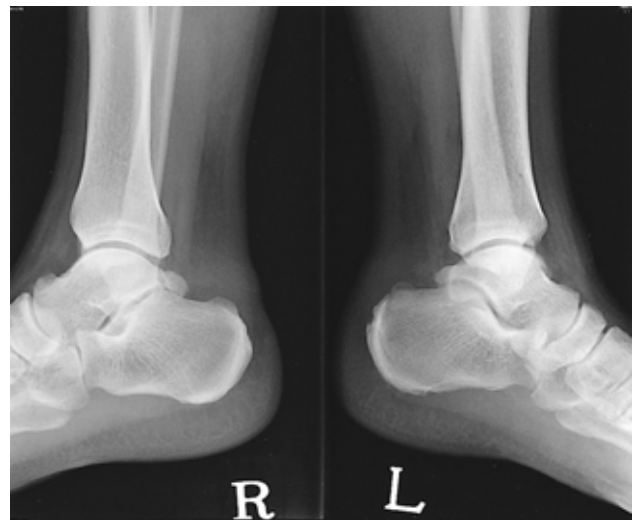
Figure 2. Plain radiographs reveal soft tissue swelling, subchondral sclerosis, and periosteitis on both calcaneal bones. More erosive bony changes on the posterior and plantar surface of the left foot are identified than that on the right side.

The radiological finding of the sacroiliac joints revealed mild marginal irregularity and subchondral sclerosis at the left joint surface (Figure 1). In addition to periostitis, soft tissue thickening, and subchondral sclerosis along the inferior and posterior aspects of the calcaneus, bony erosion was also