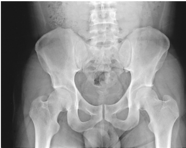
Figure 1. Blurring of the cortical margin of the subchondral bone and sclerotic change is noted on the surface of left sacroiliac joint.

fatigue. The patient had a medical history of urethritis with a recurrent dysuria and pyuria, which was intermittently treated with systemic antibiotics.