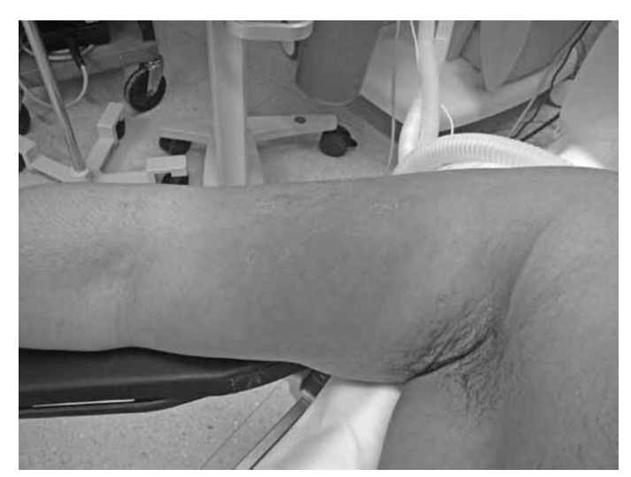
Figure 2 - Hyperemia in right arm.