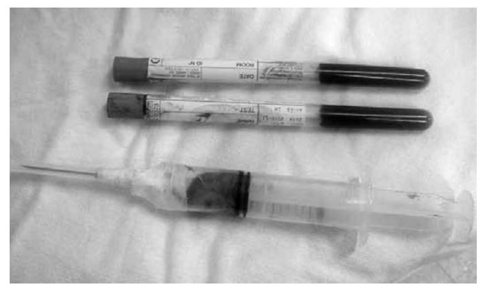
Figure 1 - Material collected for culturing.

Case 2 - The patient was a 31-year-old male bodybuilder from São Paulo, SP, who was attended as an outpatient with a complaint of pain and edema in his left arm. He had made use of anabolic steroids several times, and the last application was three days earlier, at the training place. On physical examination, he presented phlogistic signs at the location. The range of motion was painful and limited. He was admitted to the emergency service and underwent laboratory tests (hemogram, VHS and PCR) and imaging exami-