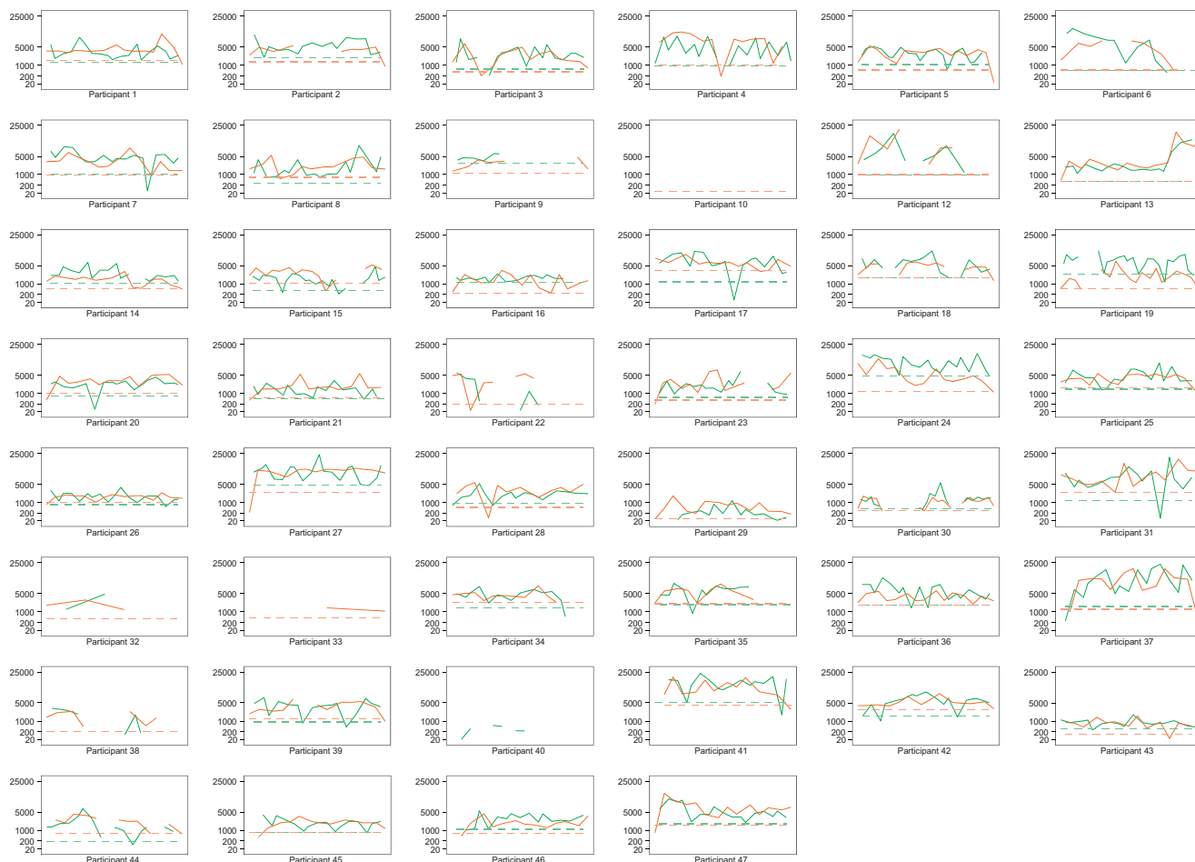
Figure 2. Total steps by days of follow-up for each individual participant: dialysis and nondialysis days. The y -axis of the line plots are shown on a cube root scale, but the y -axis is labeled with the natural scale. The x -axis shows the days that a Fitbit was worn by each individual participant. The red line connects the total steps per each dialysis day. The green line connects the total steps per each nondialysis day. The dotted lines show the individual participant's lower 80 % confidence limit for dialysis (red) and nondialysis (green) days.

accuracy is relatively poor. 12,13 Further, wearable tracker technology is constantly evolving and is not consistent across different products, 6-9,11 We speculate that future products may be more accurate and thus may reduce the observed within-patient variability in step count.