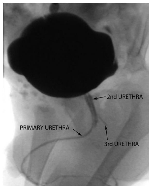
FIG. 1. Voiding cystourethrogram, observing hypoplastic urethra running parallel to the main urethra (2nd urethra), and perineal urethra in Y (3rd urethra).