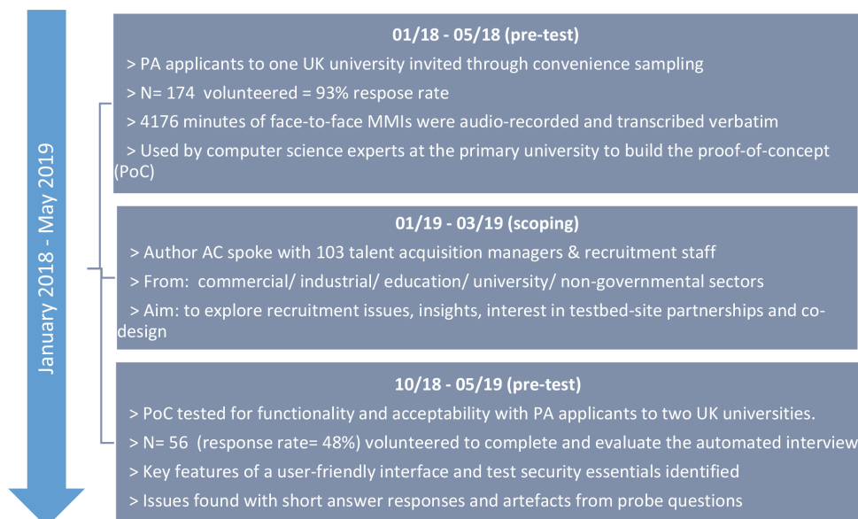
Figure 2 Scoping and pretest activity. PA, Physician Associate.

Past and current health service users were involved in the initial MMI scenario development. This was to ensure that values relevant to patient experience were appropriately accommodated. The results will be disseminated to study contributors.