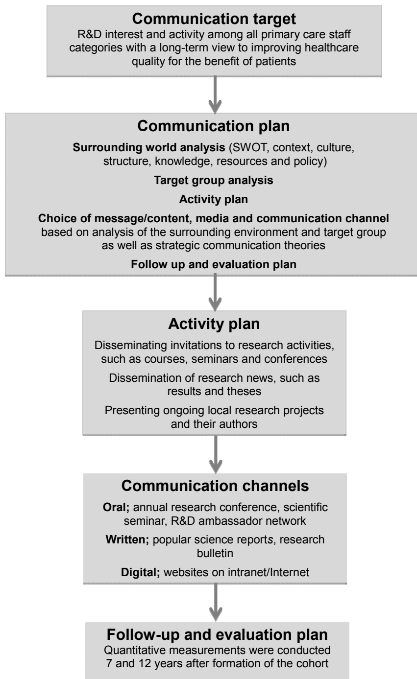
Figure 1. Intervention flow chart of measurement outcomes in relation to the goal of the communication strategy in the study cohort.

Note: The size of the initial study cohort (N = 1276).