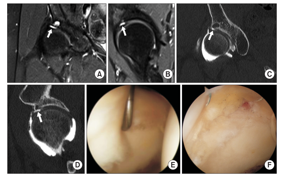
Fig. 1. Proton density magnetic resonance imaging (MRI): the coronal (A) and sagittal (B) views showed a cartilage defect (arrows) on the right acetabulum. The defective cartilage lesion was also seen in computed tomography arthrography (CTA): coronal (C) and sagittal (D) views (arrows). Adjacent subchondral cyst of the acetabulum just above this chondral defect was observed in MRI and CTA. (E) Labral tear. (F) This lesion could be confirmed in arthroscopic examination after labral repair.

According to the Lage morphologic classification, arthroscopic examination revealed longitudinal peripheral tears in 18 hips, four radial fibrillated tears, two radial flaps, and two unstable tears. The MRI findings of observer 1 include 13 hips with longitudinal peripheral tears.