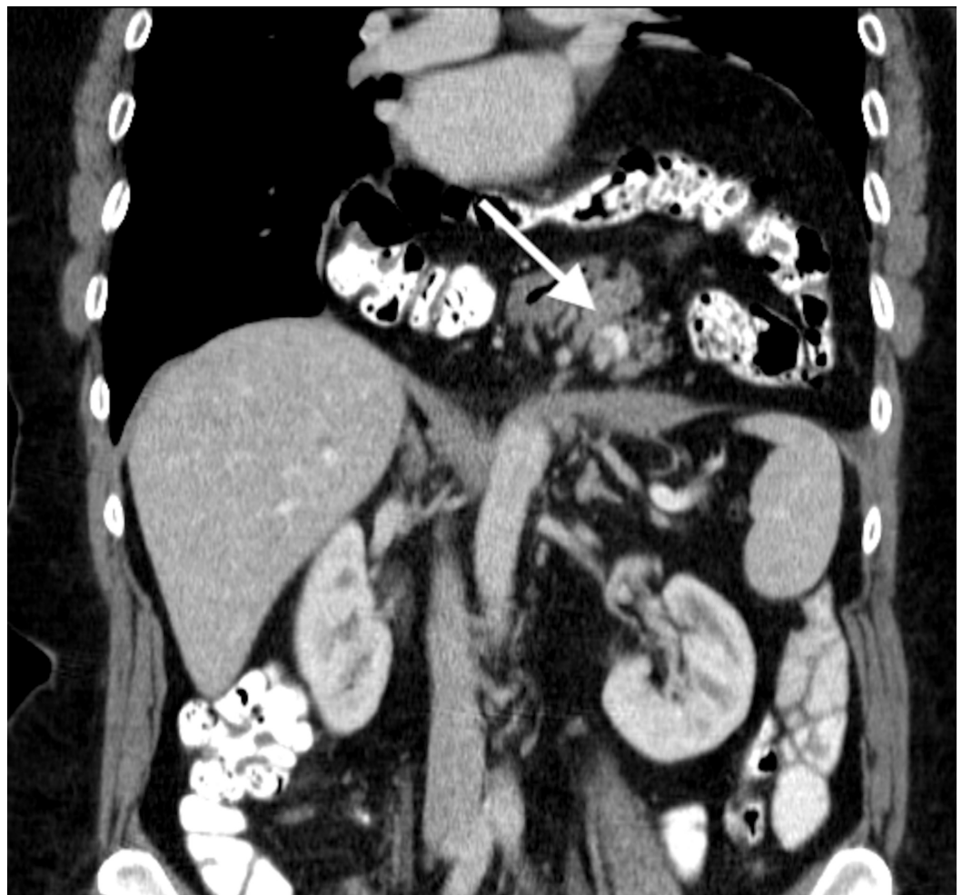
FIGURE 2: CT-scan of Patient B depicting herniation of the pancreas into the thoracic cavity.

A 66-year-old woman with a history of a laparoscopic cholecystectomy was referred for outpatient evaluation due to progressive complaints of pressure on the chest and shortness of breath after exertion without chest pain. These complaints gradually worsened in a period of two years to the point where the patient was no longer able to walk, ride her bike or sing. She also suffered from dyspepsia. A CT-scan revealed a giant hiatal hernia with complete intrathoracic stomach, transverse colon and pancreas (Figure 2).