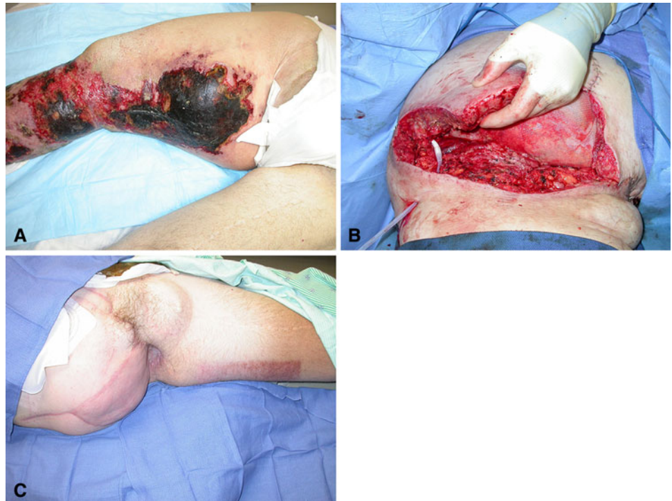
Fig. 3A–C (A) Preoperative photograph of a patient with massive chondrosarcoma recurrence involving the pelvis, perineum, and thigh. Late ischemic/necrotic changes are seen. A hemipelvectomy with perineum/genital resection was performed. (B) Intraoperative photograph after resection. The massive wound was initially managed with a wound VAC with silver negative pressure dressing followed by skin grafting. (C) Postoperative photograph 8 weeks postoperatively from resection. A well-healed skin graft is shown.

the course of the study. Related to that, wound characteristics (such as shape), adjuvant therapies, and host factors were not specifically evaluated or controlled; however, the study groups showed no significant differences in terms of immunosuppression, history of radiation, wound location, and size. Additionally, the study groups are relatively small; however, they were sufficiently large to allow us to detect significant differences between them. Finally, because this study involved a comparison of patients treated in two sequential series, the comparisons necessarily were historical. It is possible, if not likely, that other changes to treatments would have come into play during the time period in question, and it is possible, if not likely, that those cotreatments would have tended to inflate the apparent beneficial effects of silver dressings. Changes in hospital and outpatient care patterns likely also influenced issues such as duration of hospitalization over the period of time considered in this study.