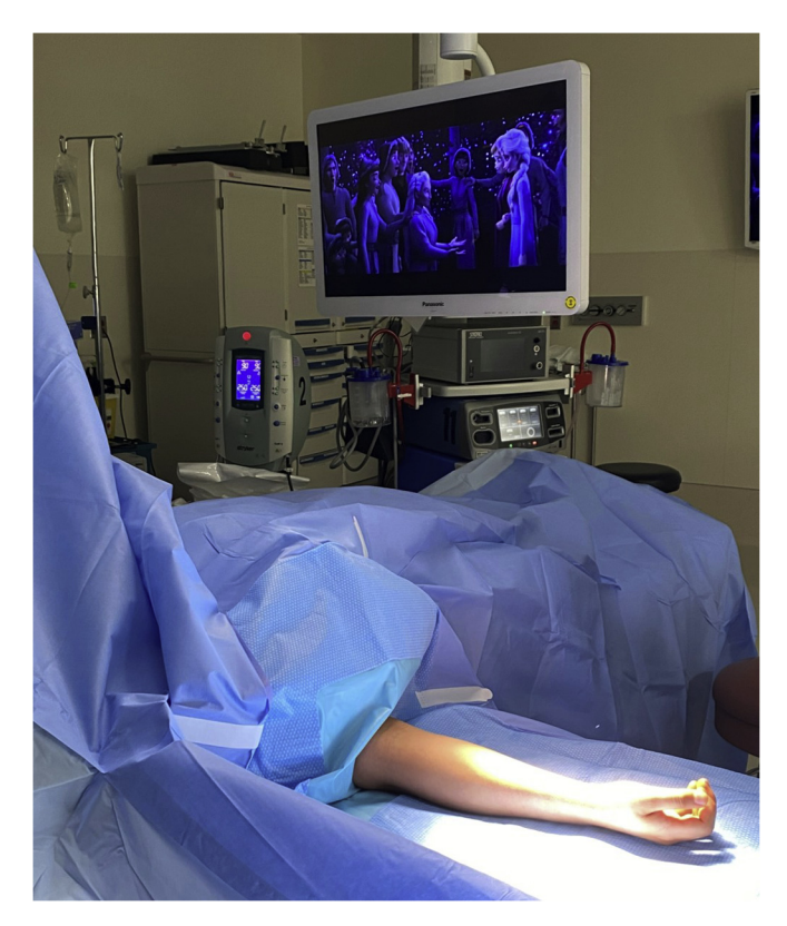
Figure 1. This figure demonstrates a pediatric patient's upper extremity sterilely draped with a movie playing for distraction.

history of anxiety? After assessment of the patient, it becomes important to engage in discussion with the parent(s) or guardian(s) and ask similar questions to determine their comfort level. If the patient and guardian appear comfortable and confident, then the patient may be a reasonable candidate for the WALANT approach. Below are lists of indications and contraindications we have observed in our practice that can serve as an initial guide.