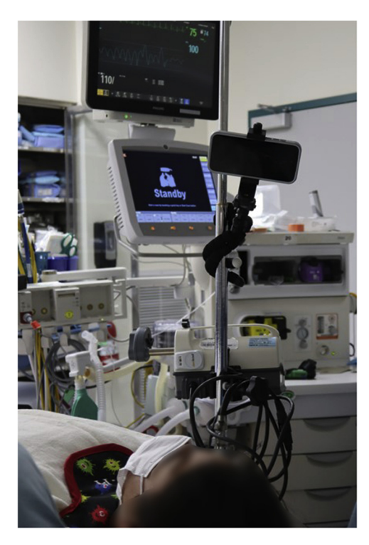
Figure 3. Universal, flexible tripod stands can be easily wrapped around an intravenous pole. Always ask the patient whether the viewing angle is okay for them.

patient will be fully asleep, may be agreed upon quickly. Instead, I recommend describing that there are 2 options for the patient, "one is a local anesthesia—only approach where we numb up part of the hand, you won't feel anything during the surgery, and you will not be watching the surgery" and "the second option is using general anesthesia, where you're fully asleep and then the surgery is performed." I then look directly at the child and say "numbing you up, so you don't feel anything and are awake, is something I think we can do for this surgery. During the surgery you will not be watching the surgery but will have the option to: (1) participate, and I will explain the steps as we go; (2) watch a show or movie; or (3) listen to music." This allows the patient autonomy to choose how they would prefer for us to interface with them during the surgery.