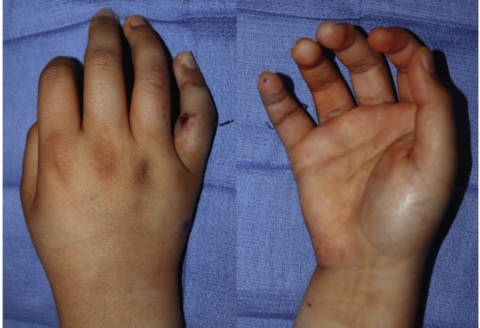
Figure 4. Case 1: WALANT little finger proximal phalanx unicondylar closed reduction and percutaneous pinning. This patient underwent WALANT closed reduction with a towel clamp, followed by transverse pinning with Kirshner wires across the fracture.