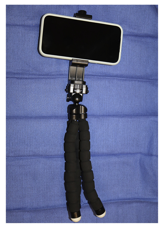
Figure 2. Universal, flexible tripod stands are used to hold a smartphone. These allow the patient to watch a show during WALANT hand surgery.