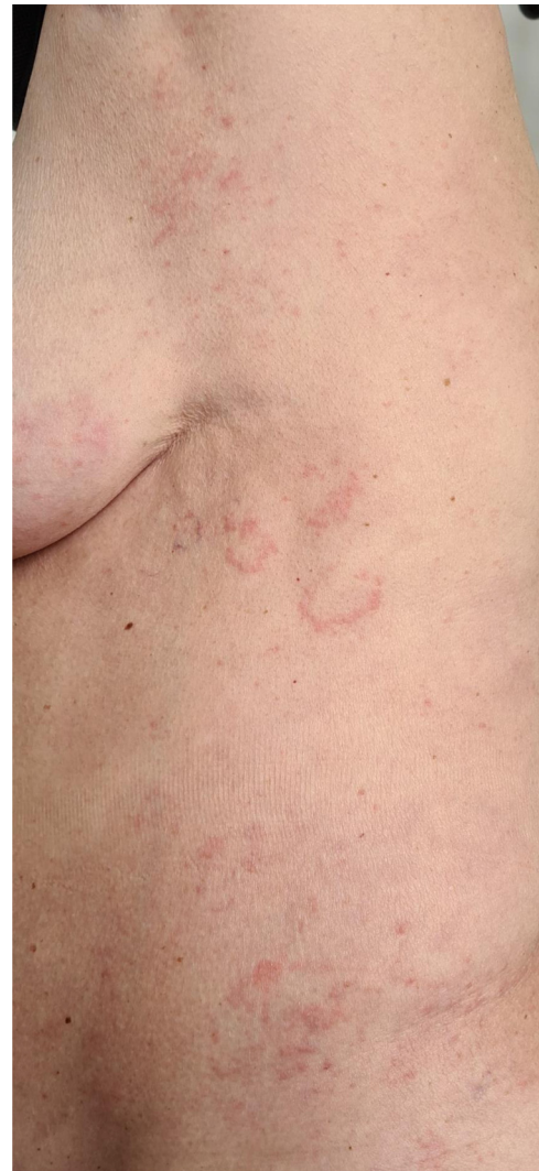
Fig. 3 DIR in a 68-year-old woman with a history of localized scleroderma and appearance of a highly pruritic erythematous papular eruption located within the limits of the morphea lesions, subsequently spreading on different areas of the body, starting on the third day after the first administration of the ChAdOx1 nCoV-19 vaccine (Oxford-AstraZeneca). The low number or absence of skin biopsies is probably due to the mild or moderate local or systemic reactions which resolve quickly only with the help of antihistamines or topical corticosteroids. In our case of “COVID arm” the patient initially agreed to give material for biopsy, but the reaction was over (dissipated) until the time and appointment for the procedure.

The Russian vaccine Gam-COVID-Vac (Gamaleya National Centre of Epidemiology and Microbiology), also known as SputnikV, is heterologous, consisting of two components: a recombinant adenovirus type 26 vector and a recombinant adenovirus type 5 vector, both carrying the gene for SARS-CoV-2 spike glycoprotein. The first phase 1/2 trial based on the data of only 76 healthy participants showed similar results to those of the other adenoviral vaccines with a good safety profile and no severe adverse reactions. Mild local adverse events were observed, such as pain and itch in the injection site, as well as hives in one patient. 50