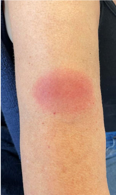
Fig. 2 DIR (COVID arm) appearing on the forearm of a patient 5 days after the first vaccination with mRNA-1273 (Moderna, Inc.). DIR, delayed inflammatory reaction.

trial as those with an onset on or after day 8) occurred in 244 of the 30,420 participants (0.8%) after the first dose and in 68 participants (0.2%) after the second dose. These reactions include erythema, induration, and tenderness. In most of the cases, the reactions resolved in 4 to 5 days.